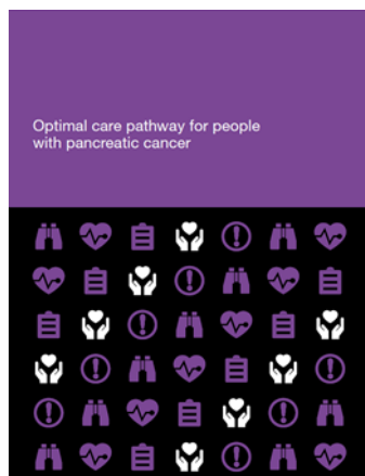
Pancreatic cancer OCP

At each summit, clinicians are asked to review data on treatment planning and delivery across Victorian public and private health services and agree on priorities for improvement. The Optimal Cancer Care Pathways (OCPs) as well as relevant clinical guidelines are used to describe the standard of care. The Pancreatic Tumour Summit is the sixth in a series of tumour specific events held since 2014.